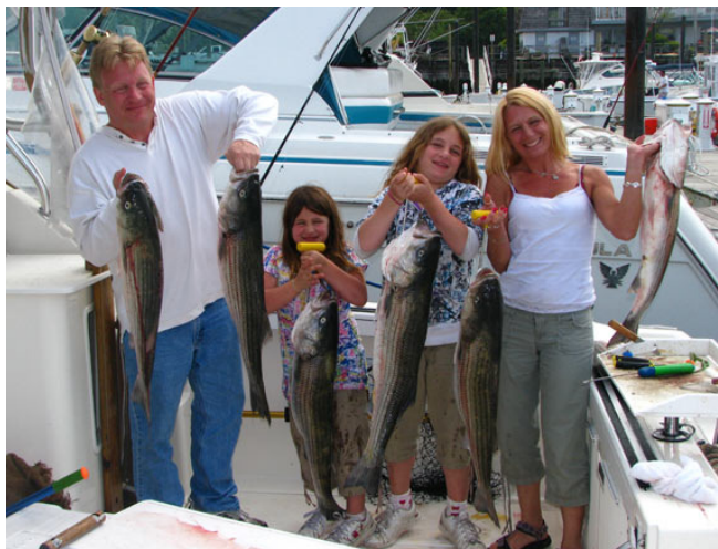
Beginners, Experts and Families Welcome

Whether you are looking for a fast paced fishing trip that gets the adrenaline going, a laid back fishing experience, a family friendly day of fishing on the water or the Trophy fish of a lifetime, let us tailor a trip to meet your needs.